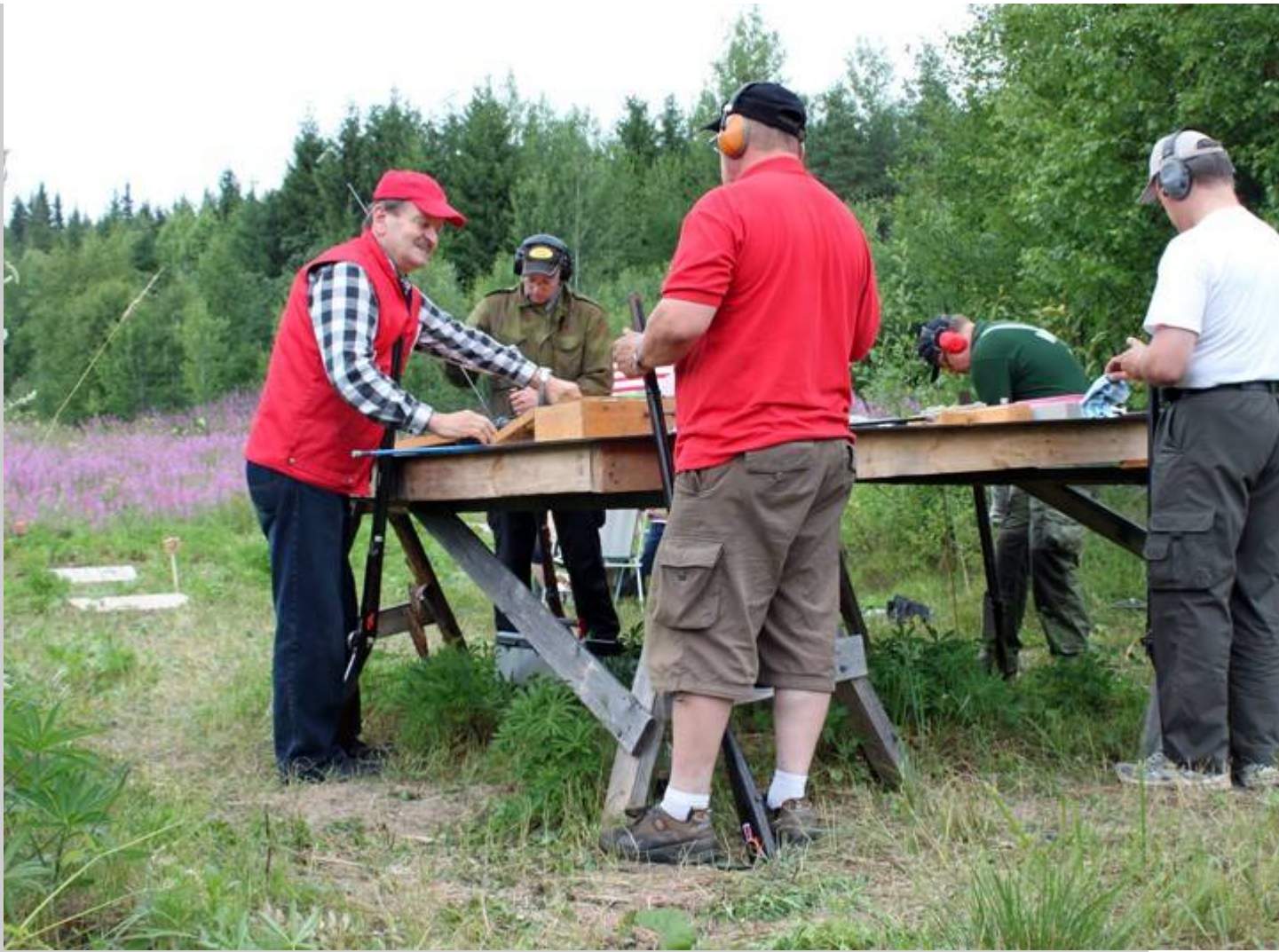
Lorenzoni shooters. This is the competition for percussion muzzleloading shotguns.