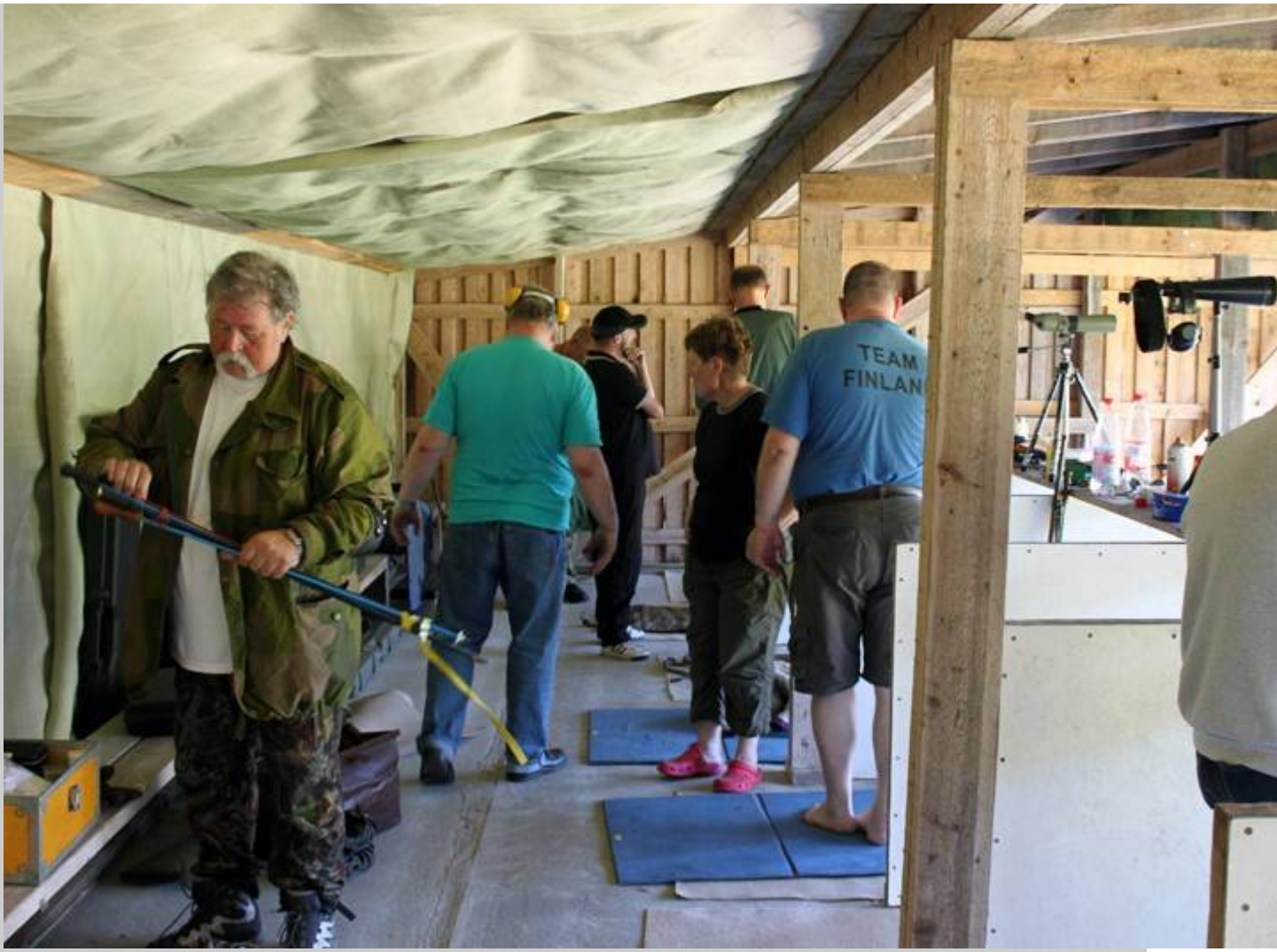
From the 100 metre range