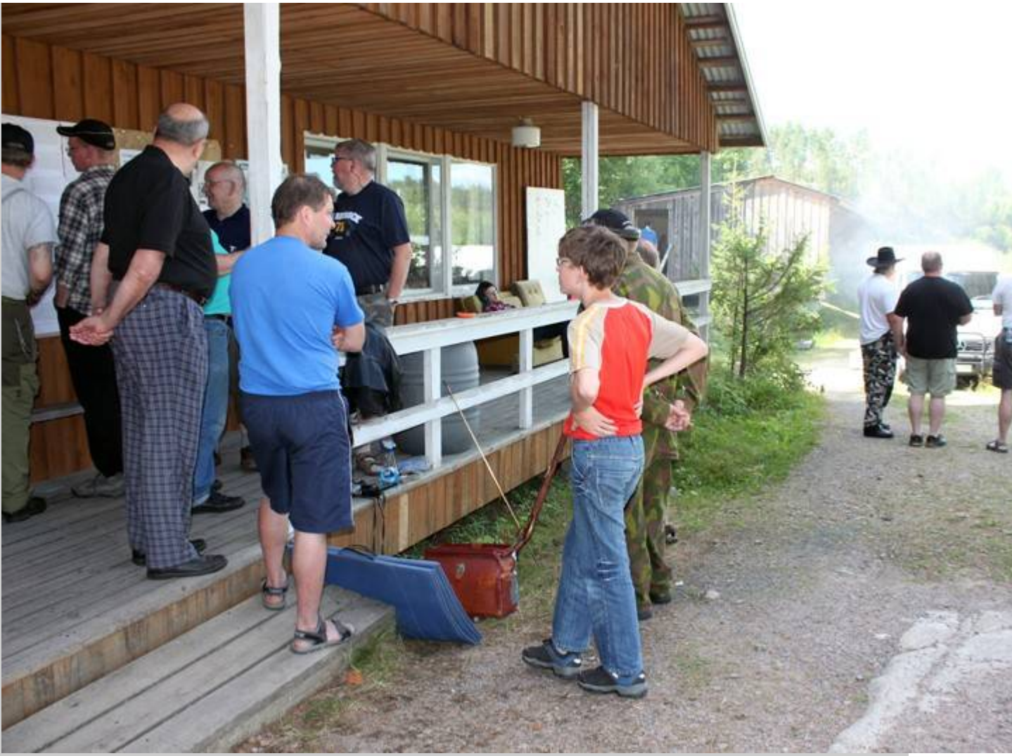
Shooters are checking their scores.