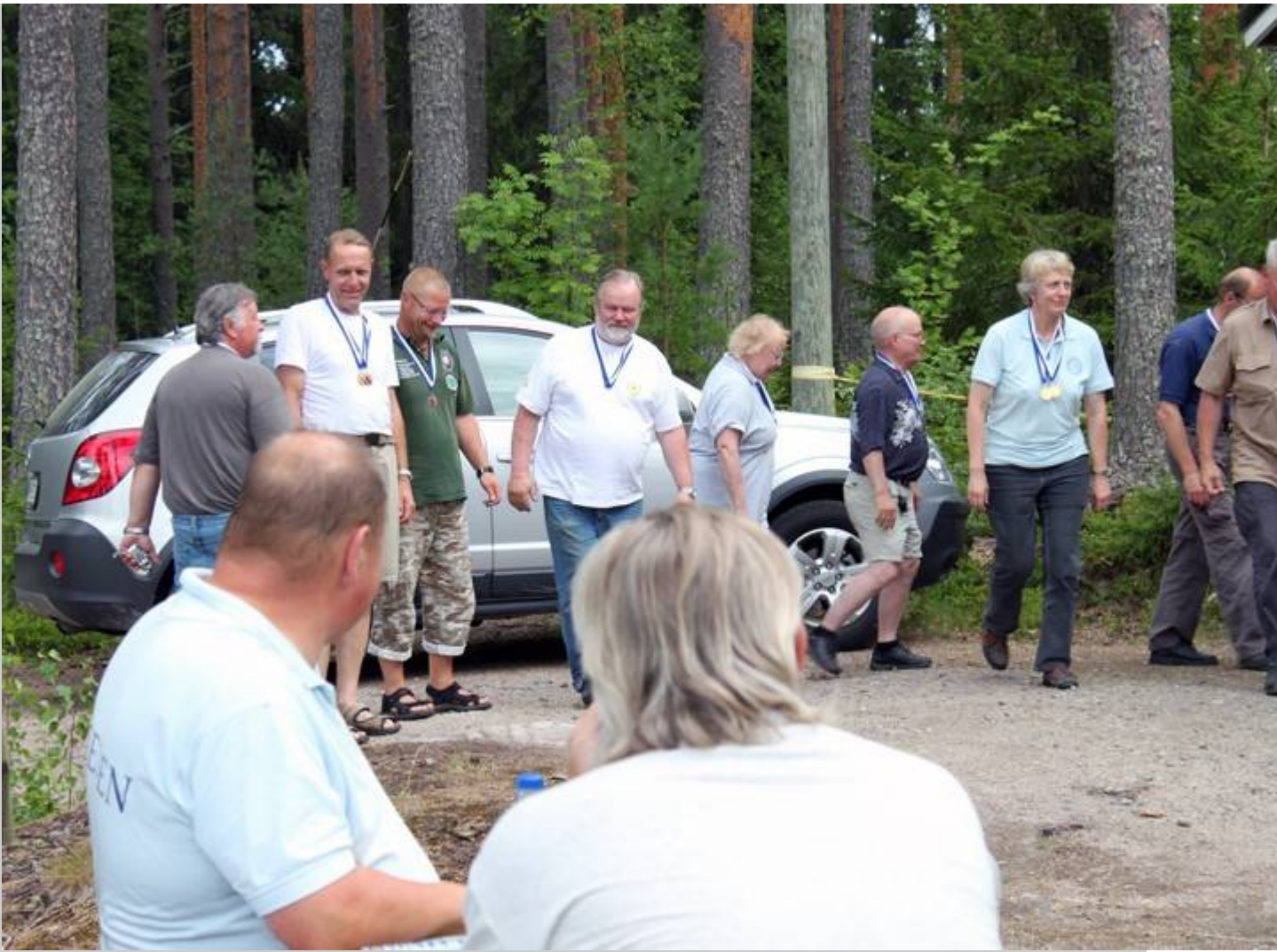
Whitworth team competition was a close race between Sweden and Finland. The two teams had the same score and the same number of tens, nines, eights. Sweden won after measuring.