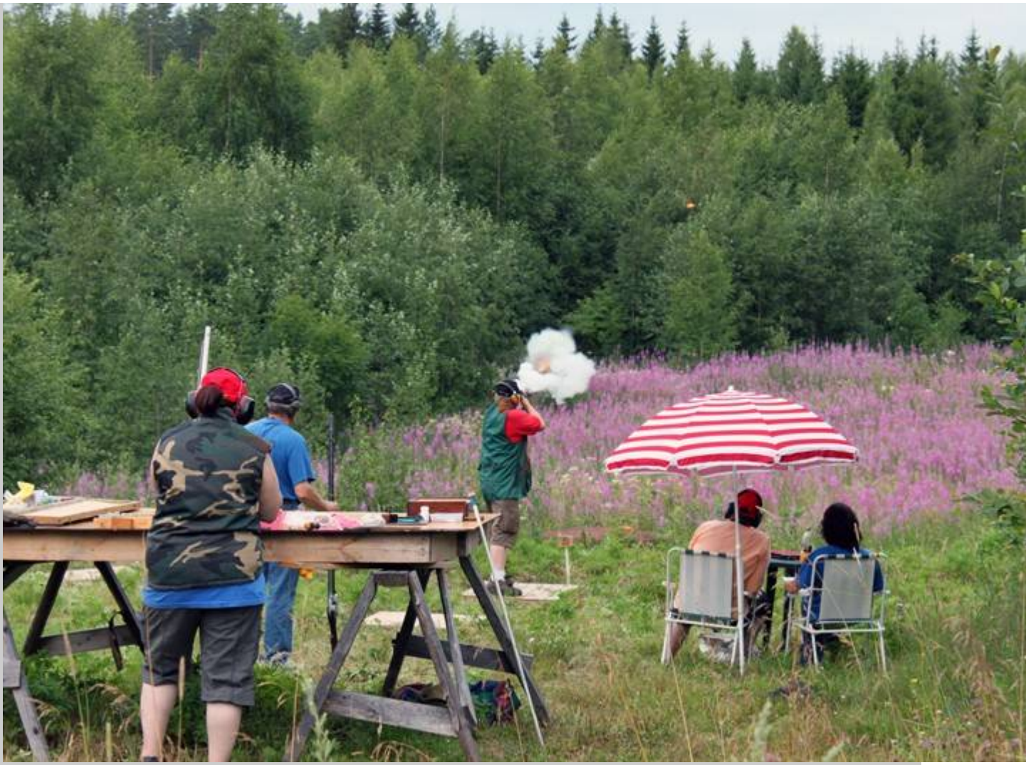
Manton (flintlock clay shooting).