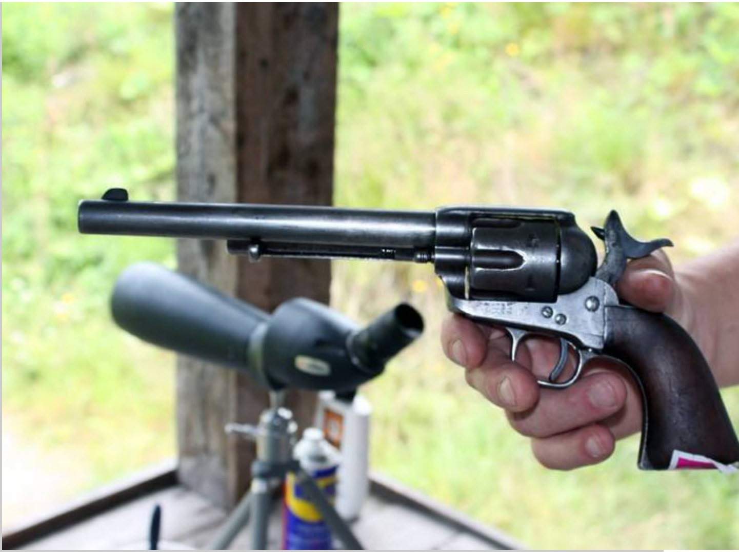
Original Colt Single Action Army.