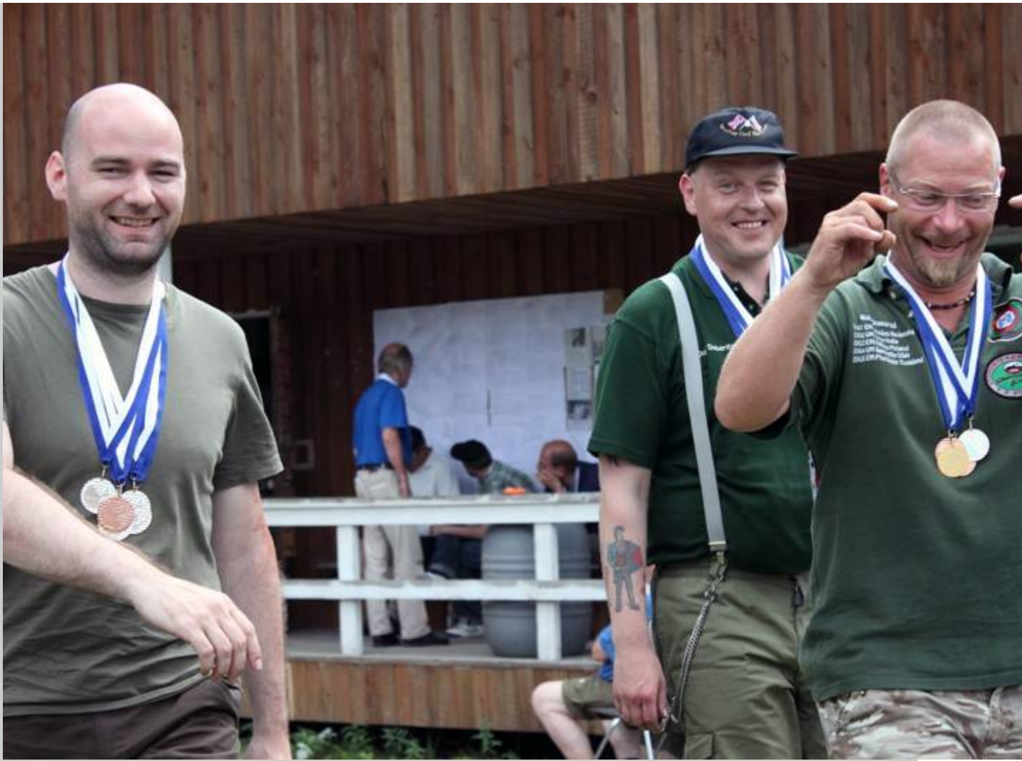
We also secured the gold medal in Nordic cup (the black powder cartridge team competition).