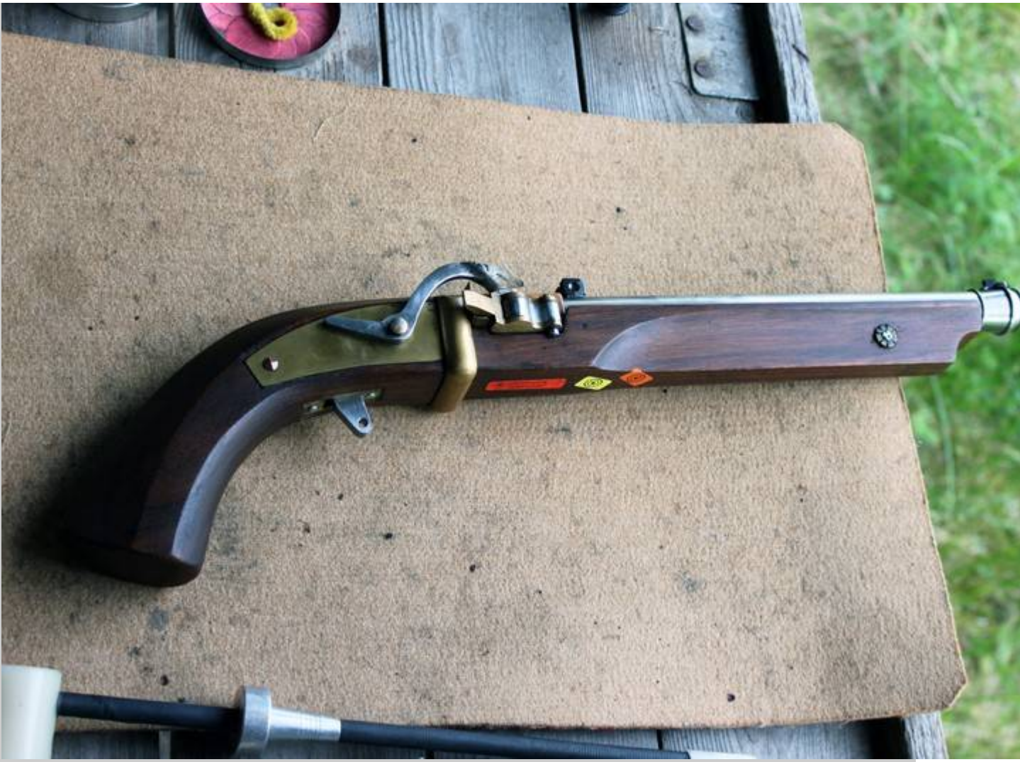
Matchlock pistol used in the Tanzutzu competition.