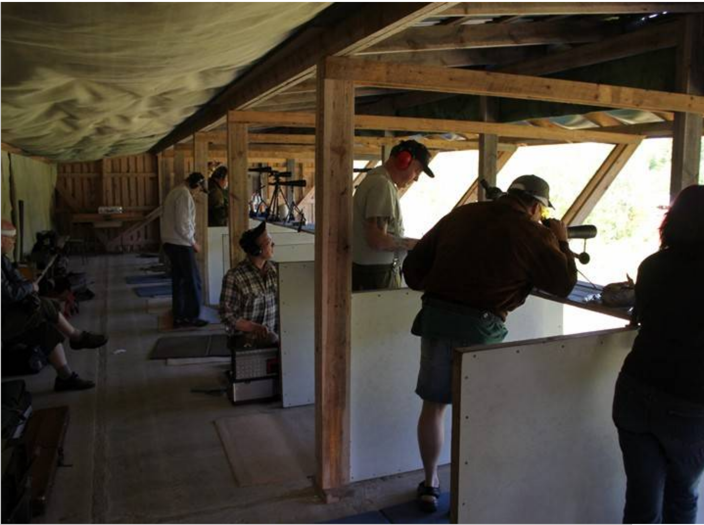
Getting ready on the 100 metre range