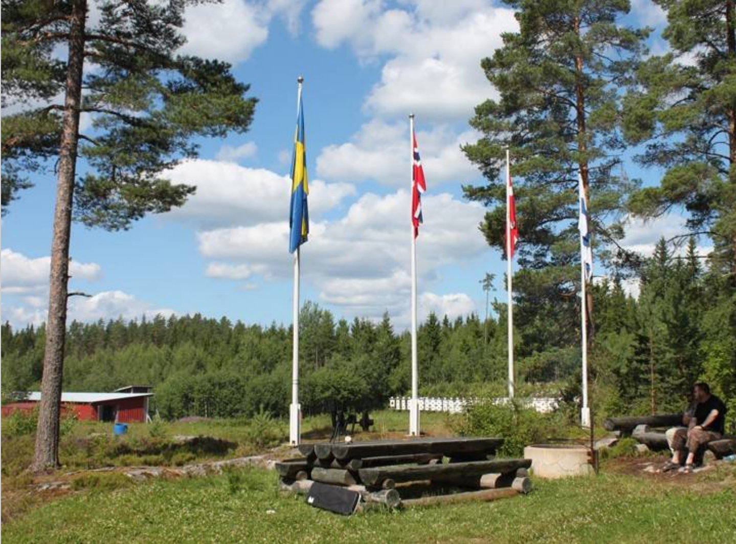
The four flags.

On Saturday evening the Finns invited the other nations to a shooter's party, with lots of good eating and drinking. A representative from the Finnish Minister of Cultural Affairs was present and handed out honorary medals to two of the Finnish black powder enthusiasts.