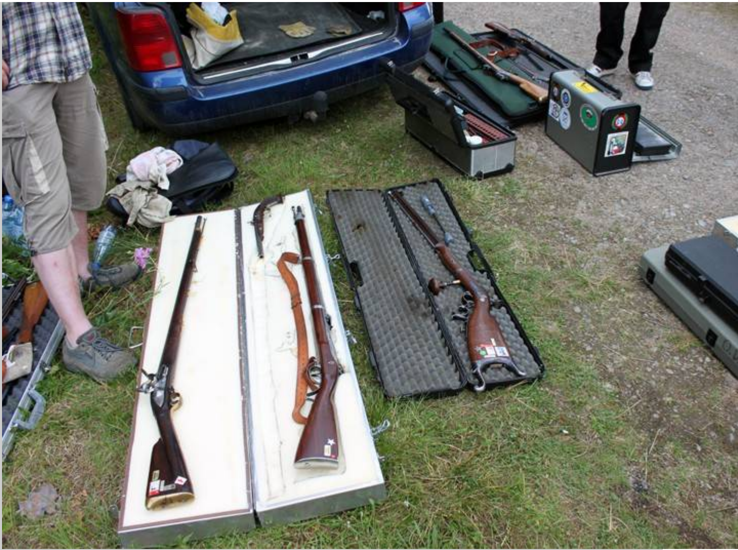
Some interesting firearms are displayed.