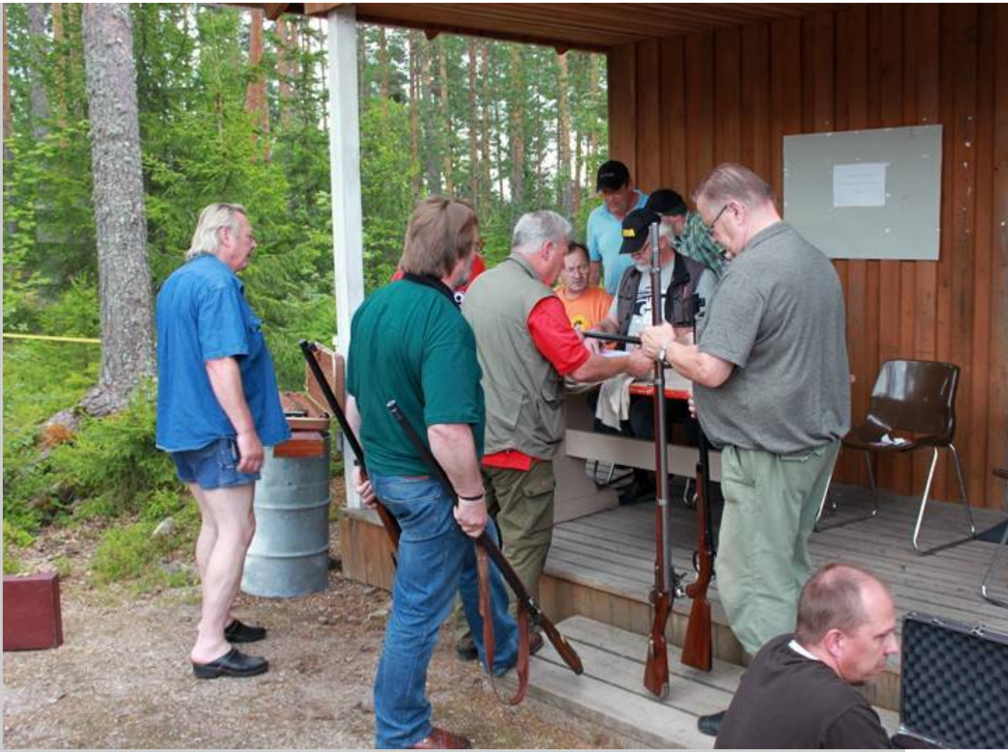
More firearms control