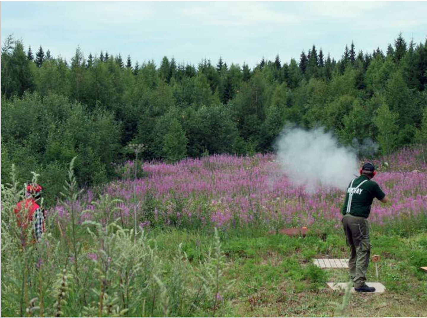
Oddvar shows what to do with a clay pigeon.