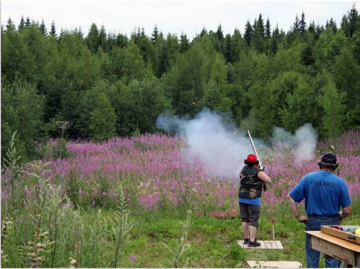
Clay pigeon breaks.