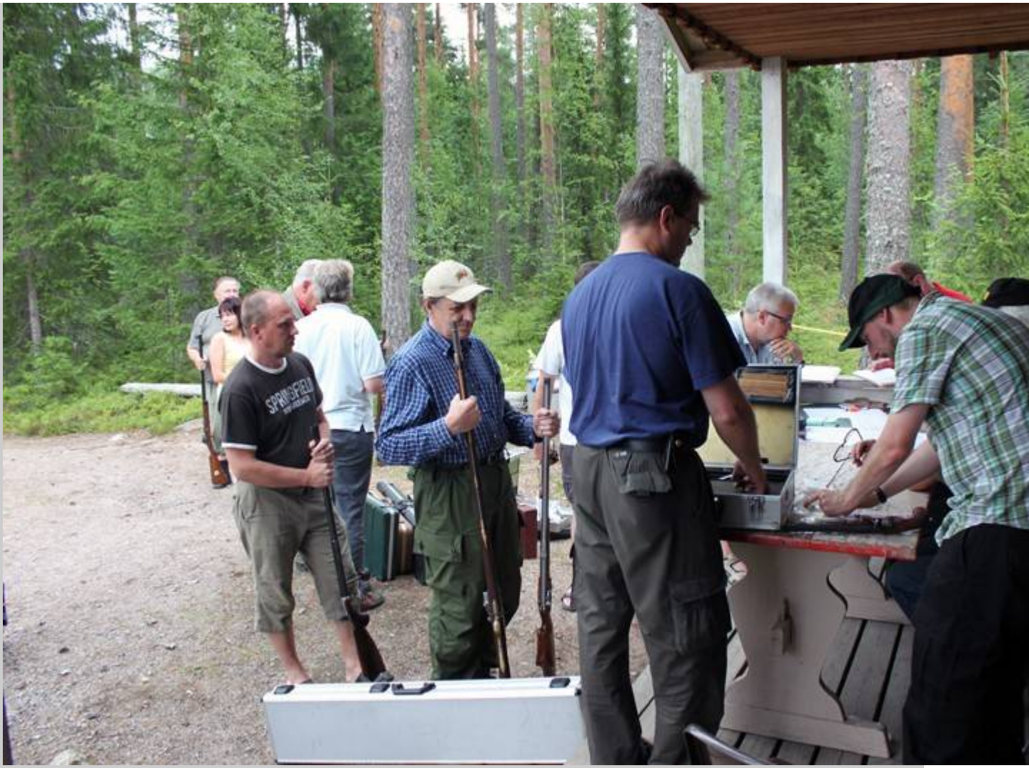
Firearms control queue.