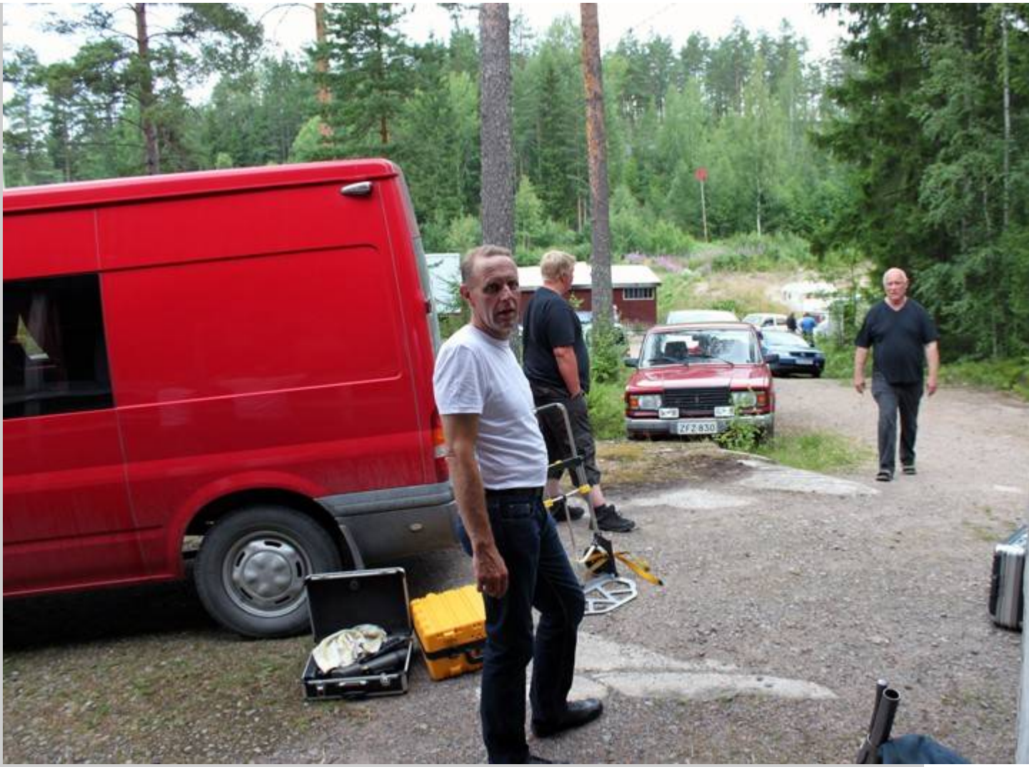
Lada – a car rarely seen anymore!